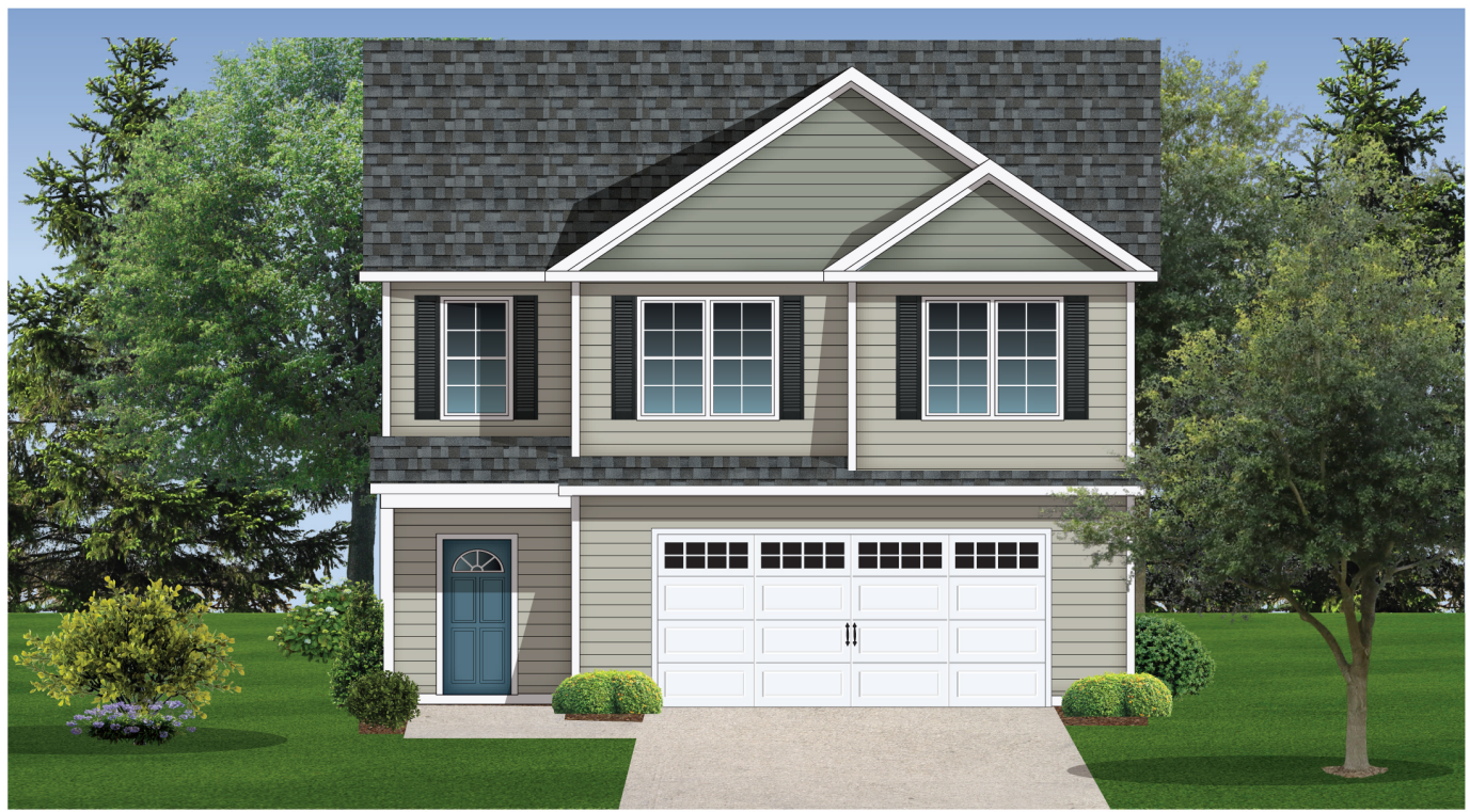
Second Floor 1300 sq. ft.