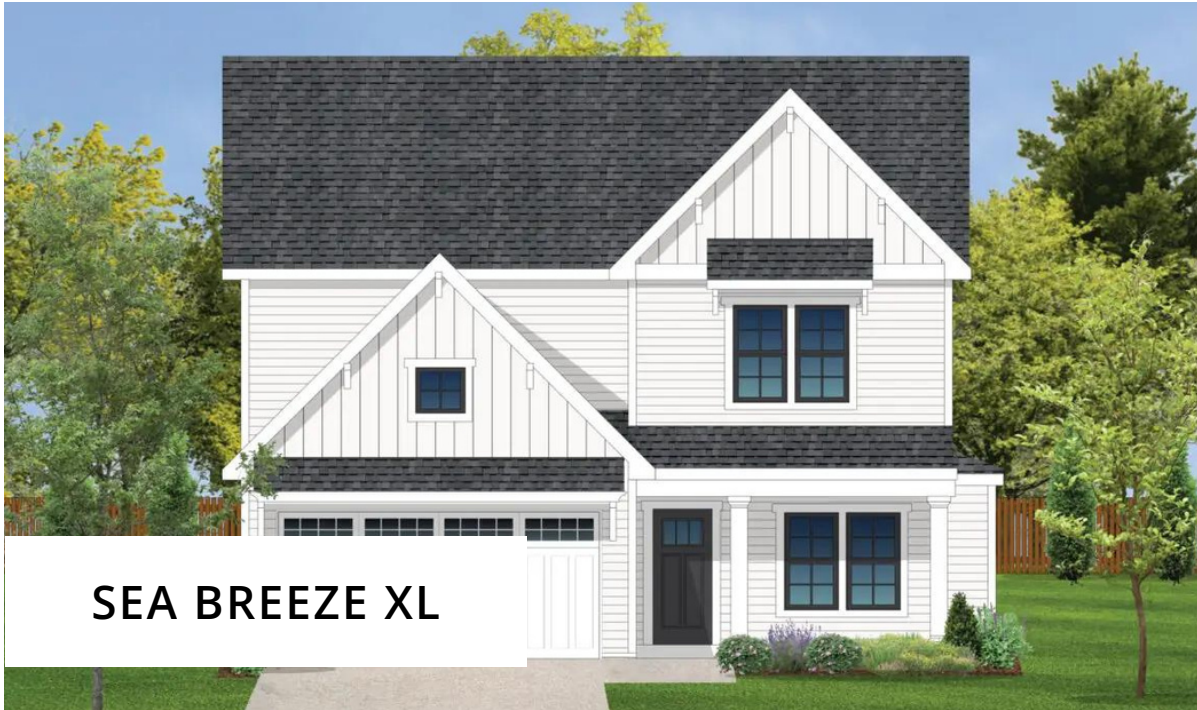
SEA BREEZE XL